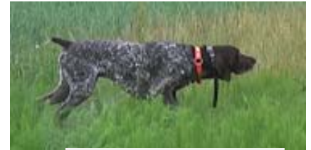
CH Awesome's Skyhi Kodiak