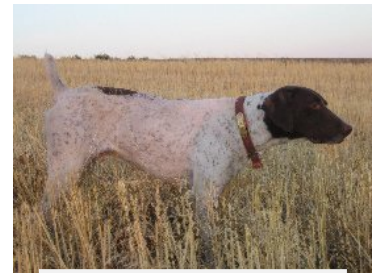
FC Dunfur's Nacho Moon